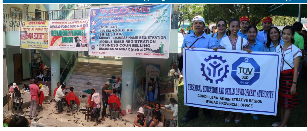
(Right) TESDA-Ifugao employees proudly display their banner during the parade in Ifugao's 51st Founding Anniversary, while graduates from Shiloh Specialized Training Institute (left) showcase their skills in a demonstration

TESDA Ifugao employees joined the civic parade on June 14, 2017 as part of the celebration of the 51st Founding Anniversary and 2017 Gotad ad Ifugao scheduled on June 11-18, 2017/. This year's theme is Ipaptok tauy Ifugao! (Let us take care/nurture Ifugao!). TESDA takes part in nurturing Ifugao by promoting relevant skills training programs among the residents. The TESDA Provincial Office collaborated with the Provincial LGU on the