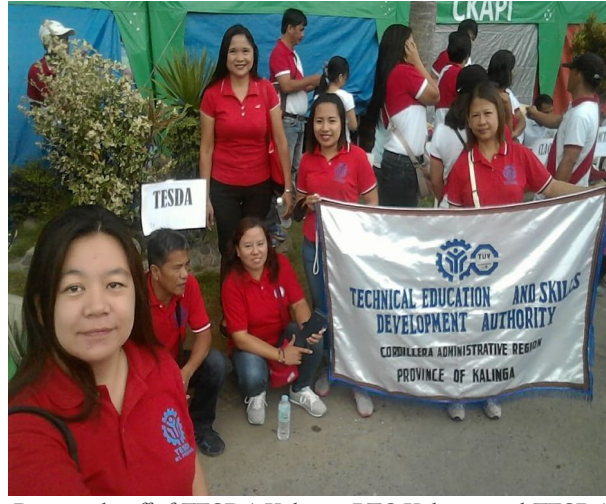
Provincial staff of TESDA-Kalinga, PTC-Kalinga, and TESDA-Mt. Province hold up the TESDA banner during the 16th Matagoan Festival Civic Parade

Different national line agencies joined and provided support to the events: jobs fair, skills and livelihood fairs and mobile licensing and registra-City Mayor Ferdinand Tubtion. ban declared June 23, 2017 a special non-working holiday in the entire city to enjoin schools and government agencies participate in the celebration.