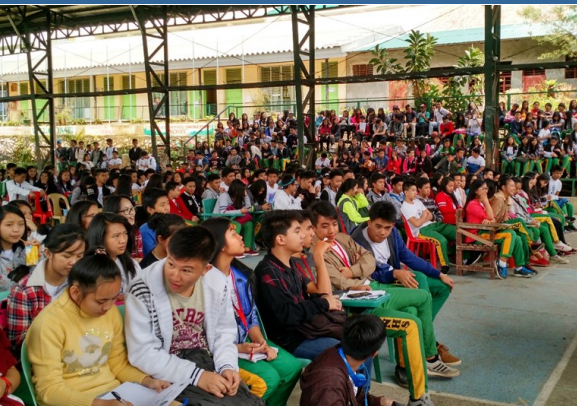
↑ Career guidance advocacy to students of San Jose National High School in La Trinidad, Benguet Participants to Regional Skills Competition pose after interview at “Naimbag a Morning Kapamilya” ↑