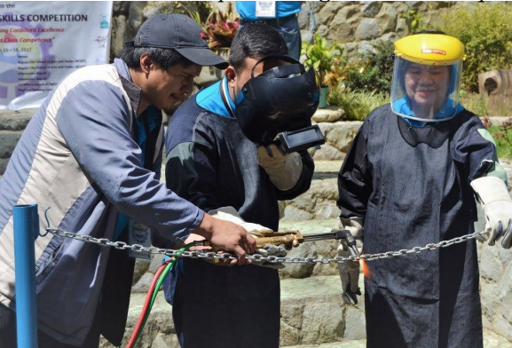
↑ Cutting of competition chain during to signify opening of Regional Skills Competition Panel interview during the screening of applicants for TESDA-CAR positions ↑